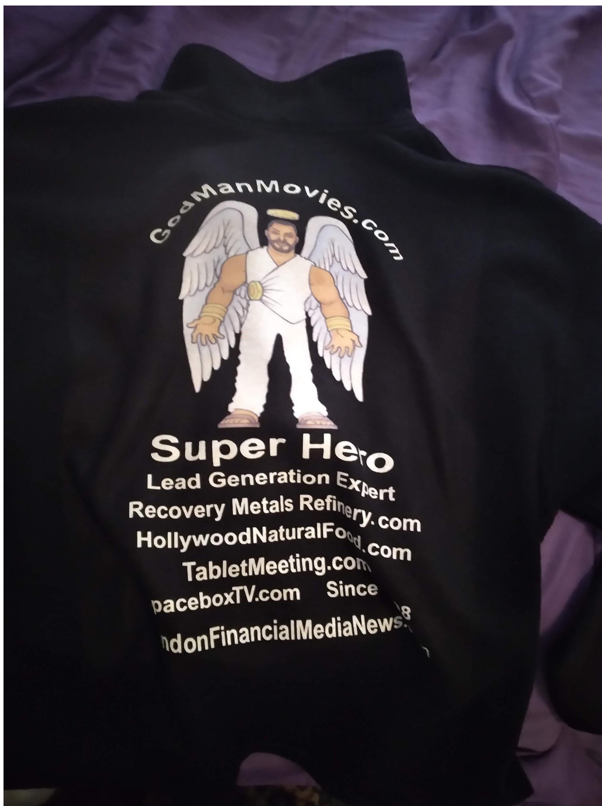
Memorabilia Jackets books cds mask children super hero dolls and prayer pillows.