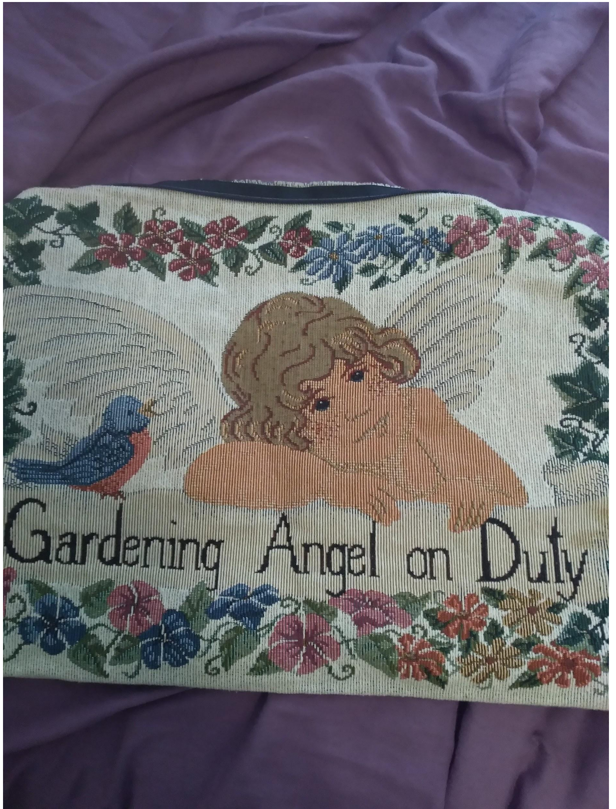
Prayer pillow for a Vow of $299.